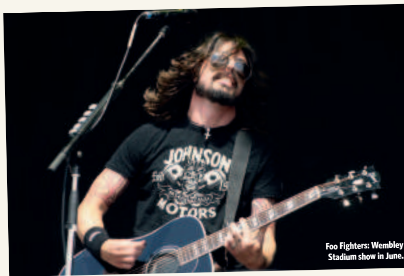
Foo Fighters: Wembley Stadium show in June.

As part of a catalogue expansion campaign that will include all of UFO's (pictured) records for Chrysalis, EMI issue the band's Phenomenon , No Heavy Petting and Force It albums on January 28. Each comes with the addition of out-takes and rare tracks, plus a lengthy sleeve essay.